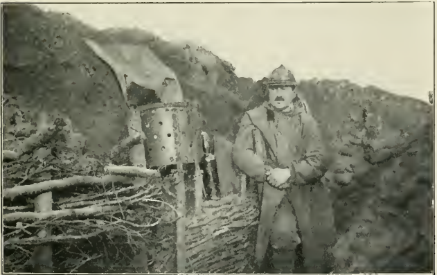
READY FOR GAS—A BRAZIER AND A BOTTLE OF GASOLENE